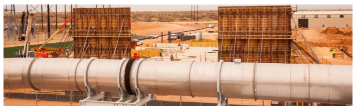
With its 24-section slab poured, wall support work has begun at WIPP's Salt Reduction Building.