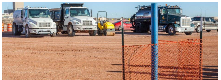
A blue pipe marks the spot where WIPP's largest shaft, the 30-foot diameter utility shaft, will be sunk 2,200 feet to the WIPP underground. Crews are routing power from a commercial substation on the east side of WIPP to the utility shaft site on the west side.

Significant progress was made in 2019 on the largest capital improvement projects at WIPP since its initial construction. This includes the Safety Significant Confinement Ventilation System (SSCVS), which will be the largest containment fan system in the DOE complex and will significantly increase airflow underground. Work on the system's three major facilities has included subsurface excavation, concrete pours, installation of steel components, and laying of utilities. Work also got underway on a new utility shaft. The 30-foot-diameter shaft will descend 2,200 feet, and will be the largest at WIPP, providing air intake for the SSCVS. Additionally, the site began paving an on-site bypass road that will relocate busy area oilfield traffic away from the WIPP site.