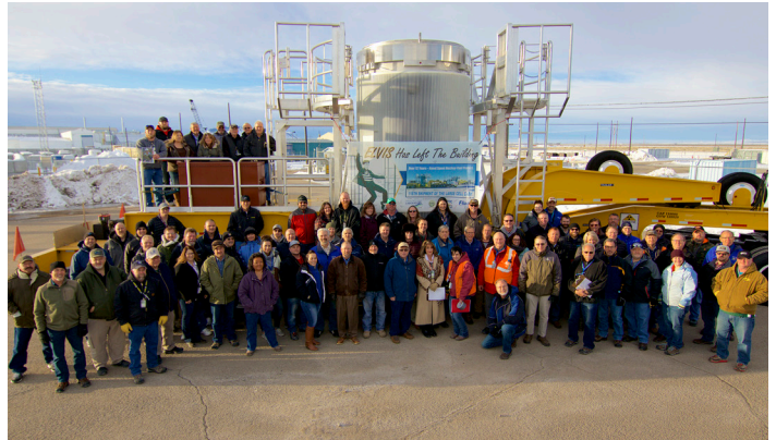
Fluor Idaho employees celebrate the last shipment of Navy spent nuclear fuel from the Idaho Nuclear Technology and Engineering Center.

The cleanup contractor continued to make significant safety improvements during 2019. Employees surpassed more than 4.7 million hours without a serious injury or lost workday and 1 million hours without a recordable injury. DOE awarded the contractor the Volunteer Protection Program Star of Excellence Award, a significant recognition of the contractor's commitment to safety.